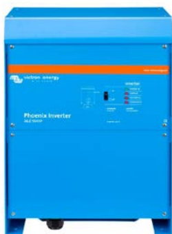
Phoenix Inverter 24/5000