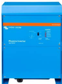
Phoenix Inverter 24/3000