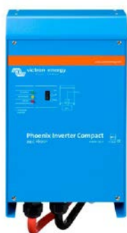
Phoenix Inverter Compact 24/1600