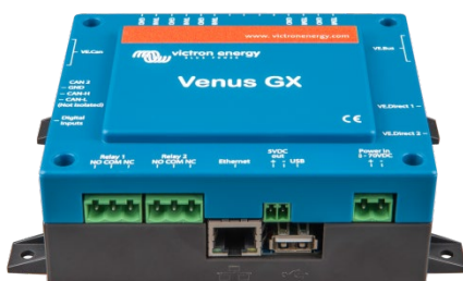
Venus GX front angle