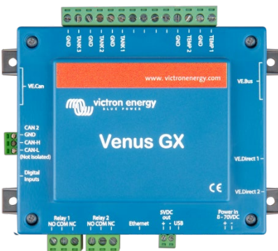
Venus GX with connectors